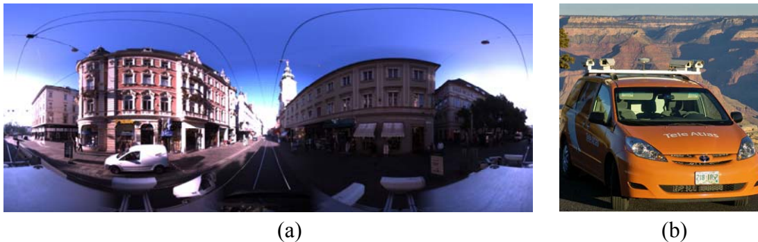
Figure 1. An example of mobile mapping imagery (a) and the Tele Atlas mobile mapping van (b).

A constituent part of the mobile mapping data warehouse is mobile mapping imagery (see Figure 1.a). The mobile mapping imagery is a set of images with known geographic position and camera orientation collected by a mobile mapping van (see Figure 1.b) during the process of map making.