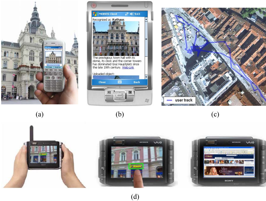
Figure 2. Image based recognition of urban points of interest is initiated by an image capture about the object of interest (a) and returns annotation about tourist sights (b). User positions are tracked via GPS (c) and index into relevant map information. With similar methodology (d), mobile interfaces inform about related map information.